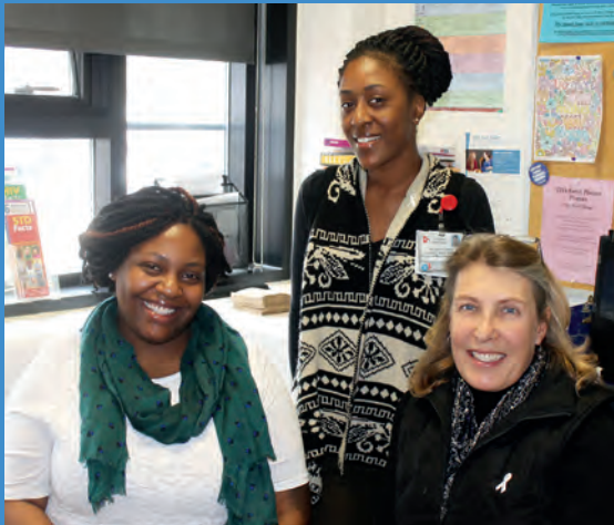
Teen Health staff